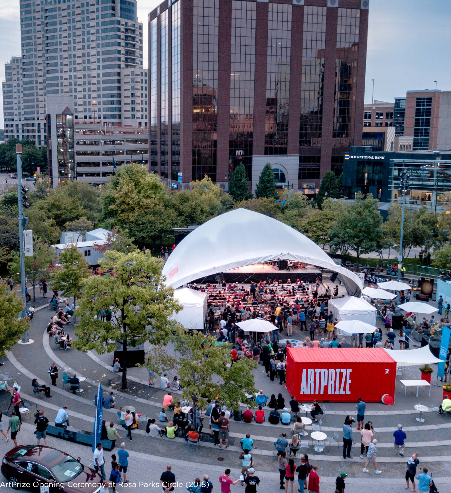
ArtPrize Opening Ceremony at Rosa Parks Circle (2018)