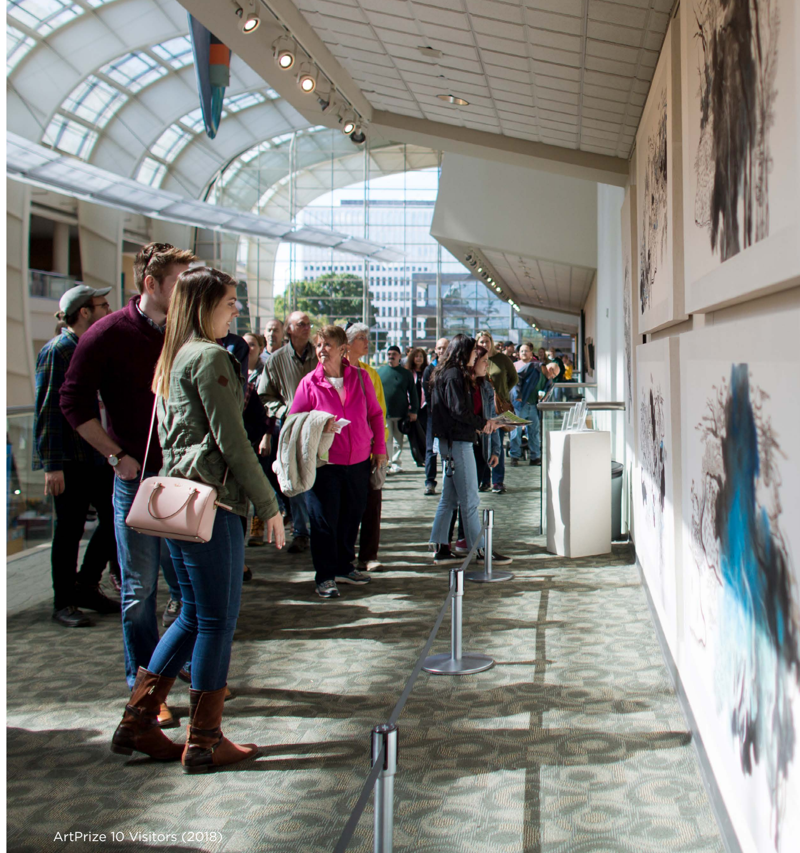
ArtPrize 10 Visitors (2018)